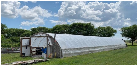
Figure 5: High tunnel at the Research Orchard, Portage la Prairie AAFC Station.