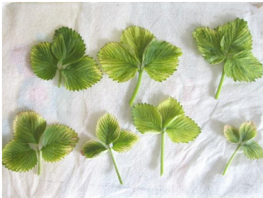
Figure 3: Iron chlorosis on strawberry leaves, note green veins with yellowing tips and interveinal regions.

Typically iron deficiency chlorosis is a common problem in fruit trees, berry crops and certain ornamental and shelterbelt species in high alkaline (soil pH >7.3) or heavy clay soils. Other conditions which can induce iron deficiency include excess phosphate in soil, along with low soil temperature, and excess quantities of copper and manganese in acid soils. Iron is a catalyst to chlorophyll formation in leaves of the plant.