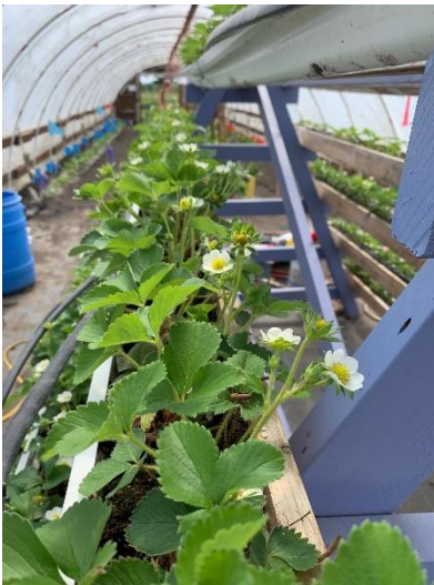
Figure 4: High tunnel planting of 'Cabot' June-bearing strawberries.

June-bearing strawberries that were started last August and overwintered are still being harvested. Harvesting is done twice a week. Cabot, a June-bearing strawberry, planted in early May has grown significantly with heavy bloom and green berries developing (figure 4). Various insect pollinators are visiting the flowers inside the high tunnel. With the cool nights in June we have been closing the north and south doors overnight/ early morning to maximize warmer temperatures in the high tunnel (figure 5).