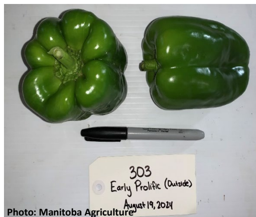
Figure 11. Harvest from the field pepper variety trials on August 19.