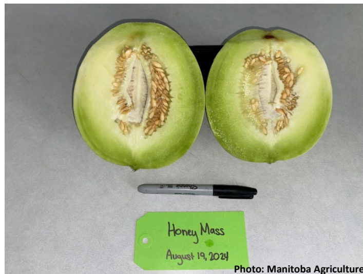
Figure 14. Harvest from the field honeydew melon variety demonstration plots on August 19.