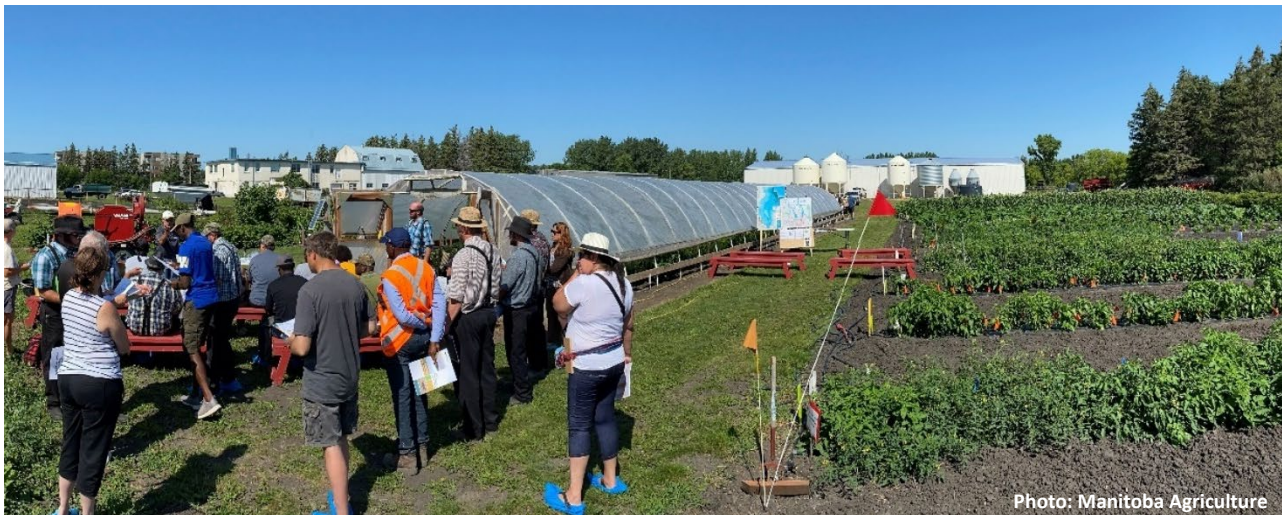
Figure 15. 2024 Horticulture School at AAFC Portage on August 1, 2024.

The 2024 Horticulture School was held on Thursday, August 1, at the Agriculture and Agri Food Canada (AAFC) Research Station in Portage la Prairie (Figure 15). Stay tuned for updates on upcoming horticulture extension events.