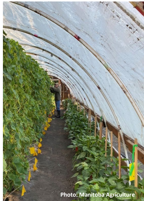
Figures 3 & 4. 2024 high tunnel vegetable plots in Portage la Prairie (July 22, 2024)