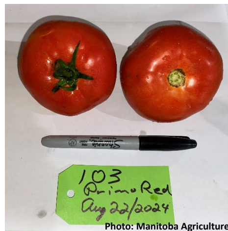
Figures 9 & 10 Harvest from the field tomato variety trials on August 19 and 22.