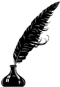
No known photo