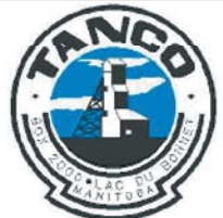
FIGURE 2.1 TANCO MINE REGIONAL STUDY AREA