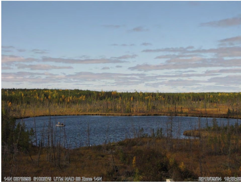
Photograph 01. September 24, 2012: Fire Pond, looking north-west ↑