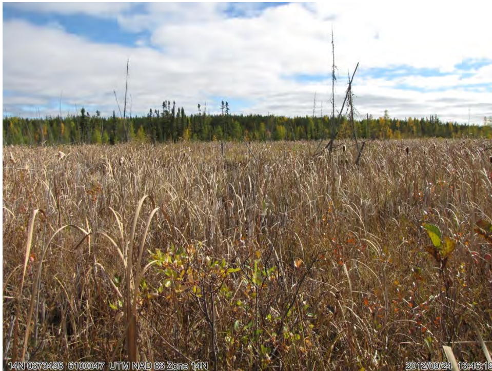
Photograph 02. September 24, 2012: Cattail Marsh in Southern End of Pit 1 ↑