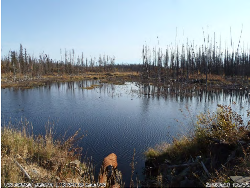
Photograph 21. September 25, 2012: PLM-04, Wetted Area and Destroyed Culvert (Foreground & Center), Looking South ↑