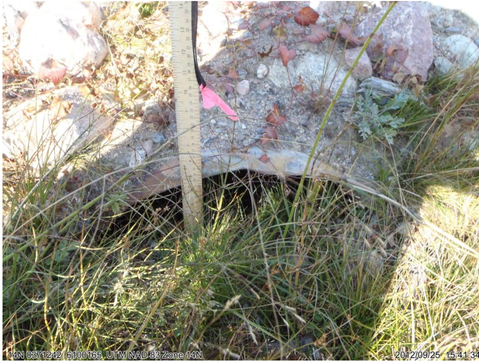
Photograph 15. September 25, 2012: PLM-02, Partially Buried ↑