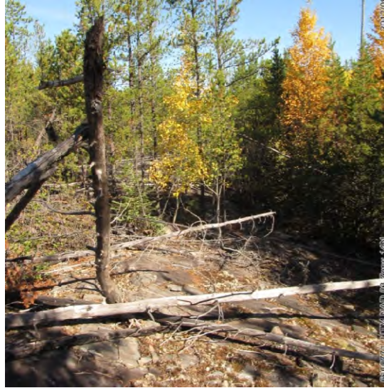
Photograph 11. September 25, 2012: Jack Pine Regeneration on Rocky Upland with Burned Deadfall near Pit 4↑