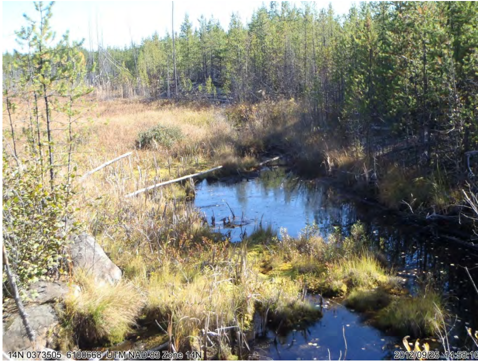
Photograph 23. September 25, 2012: Small Wetted Area Along On-Site Road, Halfway Between Underground Portal and Mill, Looking East Towards Ragged Lake TDA ↑