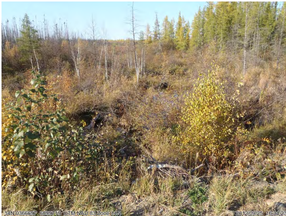
Photograph 22. September 25, 2012: PLM-04, Overland Flow, Looking North ↑