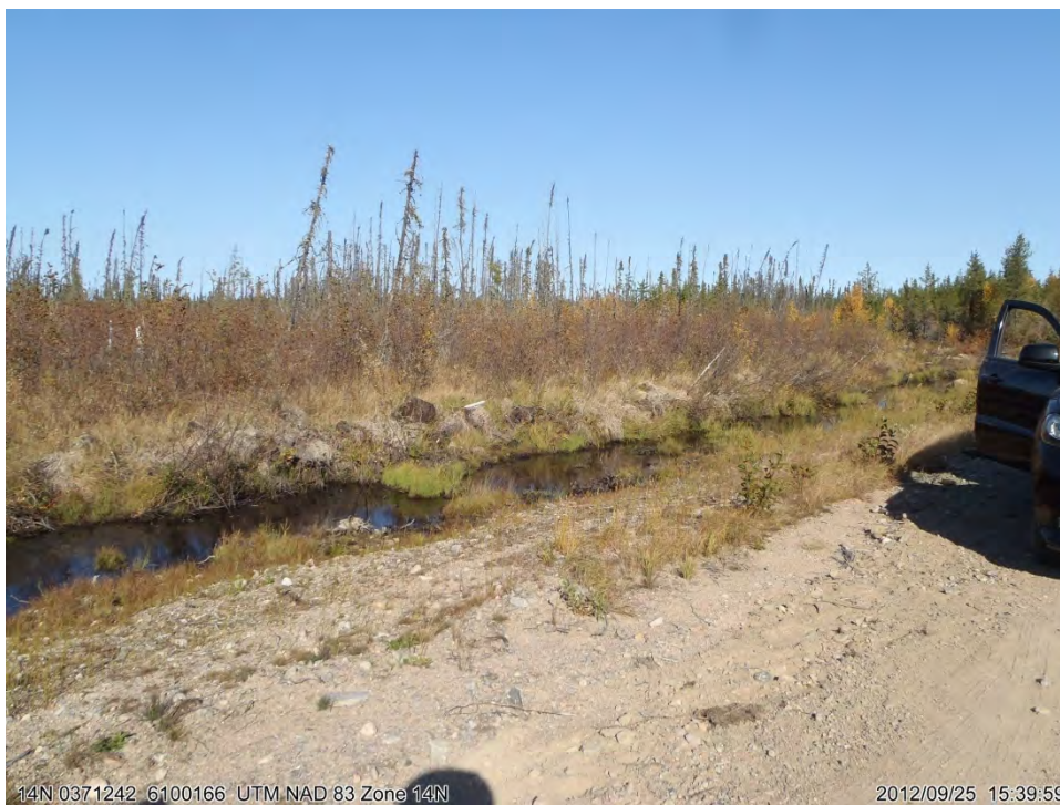
Photograph 14. September 25, 2012: PLM-01, Typical Ponded Crossing, Looking Northeast ↑