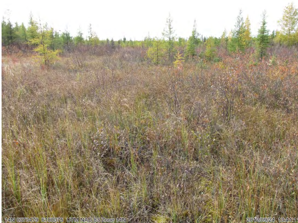
Photograph 03. September 24, 2012: Hummocky Fen in the Northern Section of Pit 1 ↑