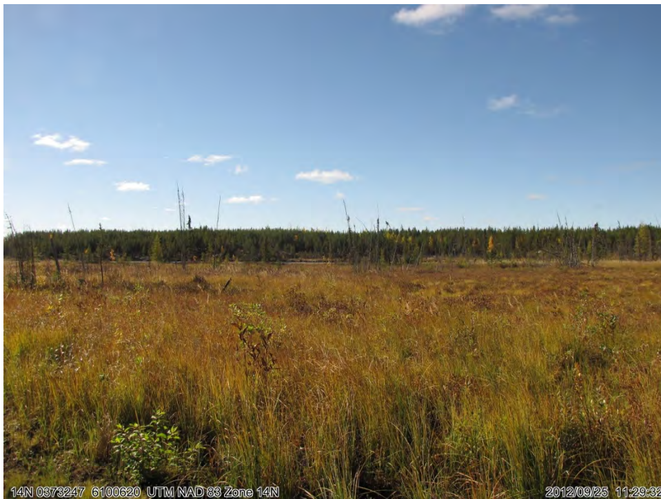
Photograph 10. September 25, 2012: General Bog Area at Pit 4 with Sedge Hummocks (foreground) and Sphagnum Mat (background) ↑