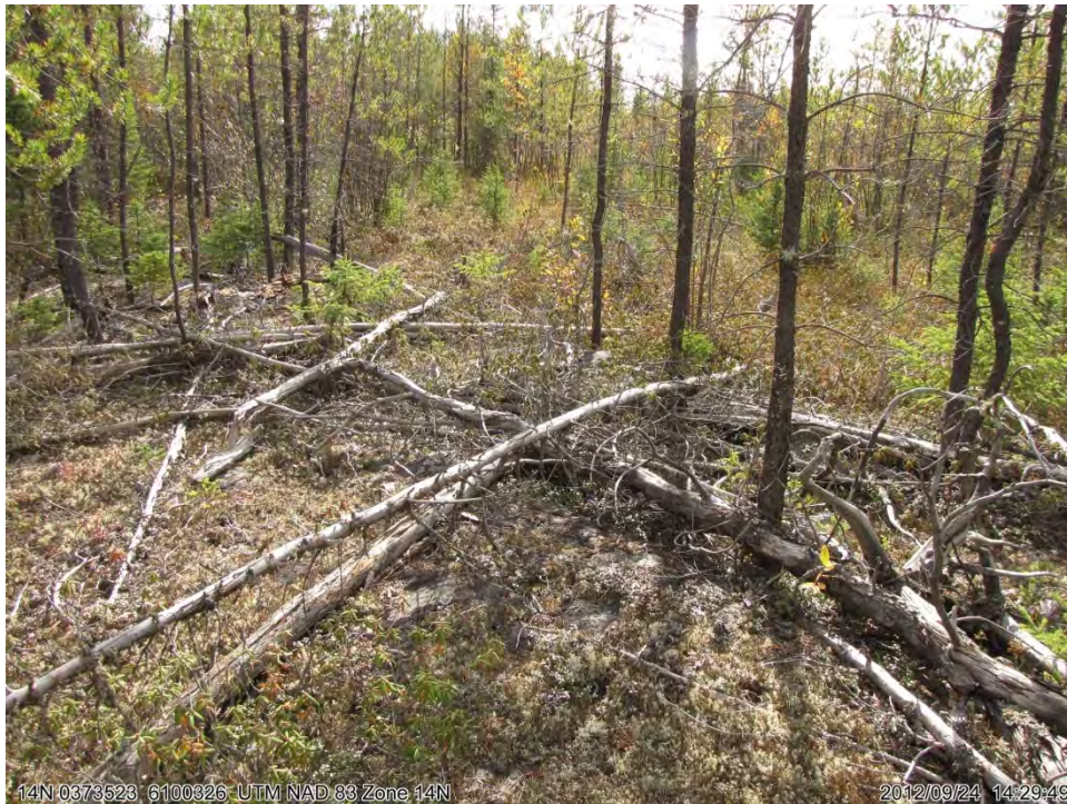
Photograph 08. September 24, 2012: Burn Deadfall near Pit 3 ↑