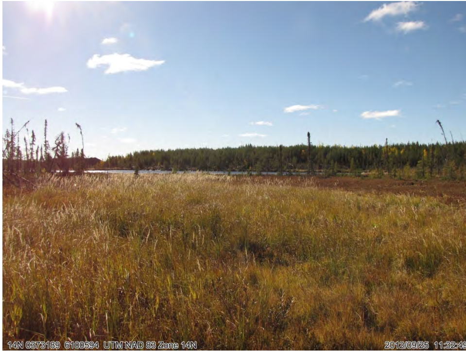
Photograph 09. September 25, 2012: Pit 4 with Fire Pond in Background, Looking South-East ↑