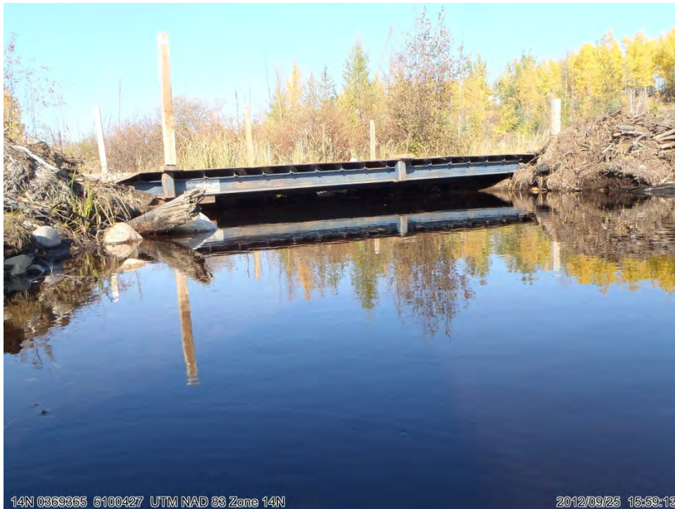
Photograph 20. September 25, 2012: PLM-03, Bridge Crossing, Looking North ↑