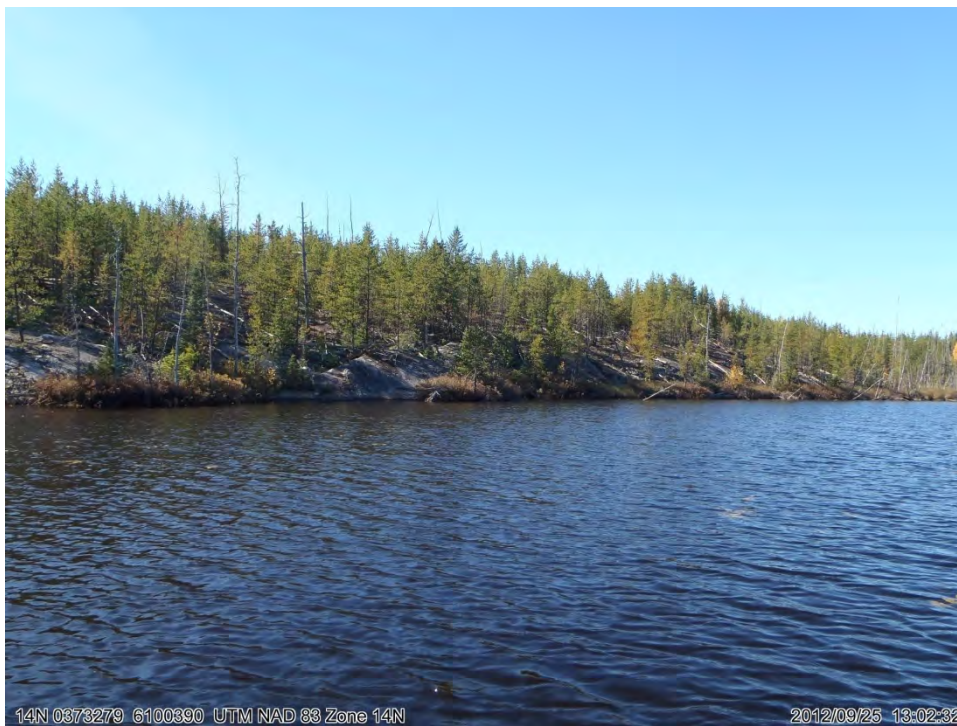
Photograph 25. September 25, 2012: Bedrock Shoreline of Fire Pond, Looking Northwest ↑