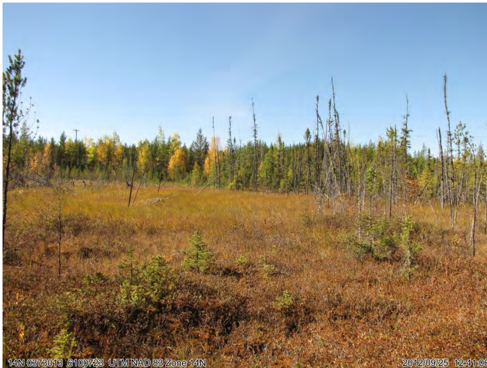
Photograph 13. September 25, 2012: Pit 5, Showing the Sphagnum Mat (foreground) and Wet Dense Sedge meadow (background) ↑