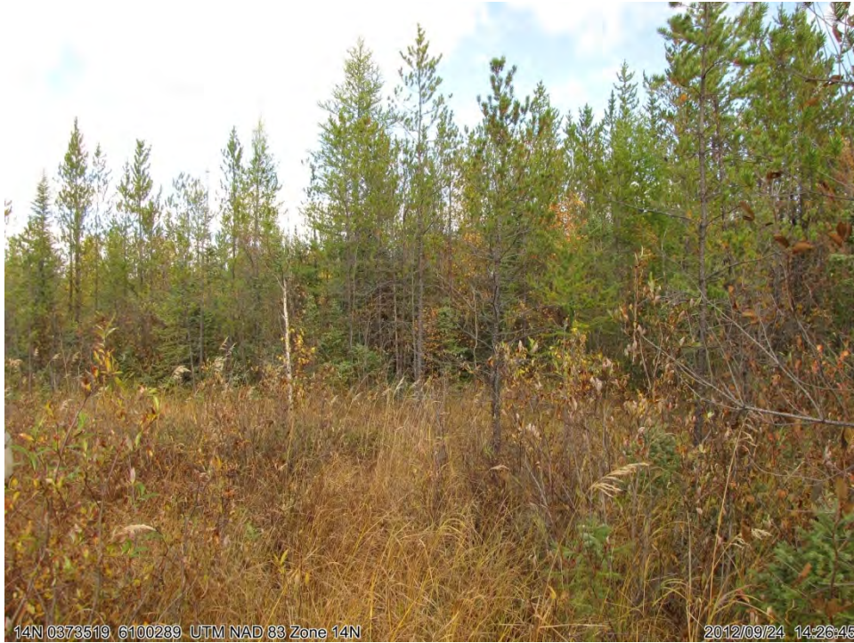
Photograph 07. September 24, 2012: Wet Fen and Upland Forest Edge near Pit 3 ↑