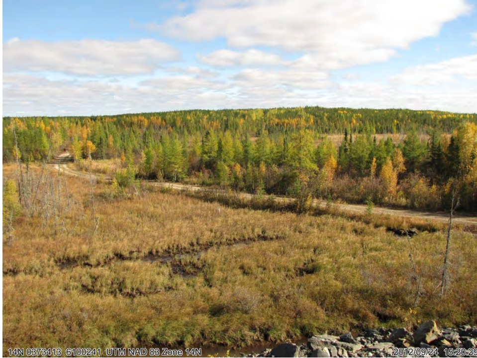
Photograph 05. September 24, 2012: Pit 1, Looking South-East with Access Road to TDA in Center ↑