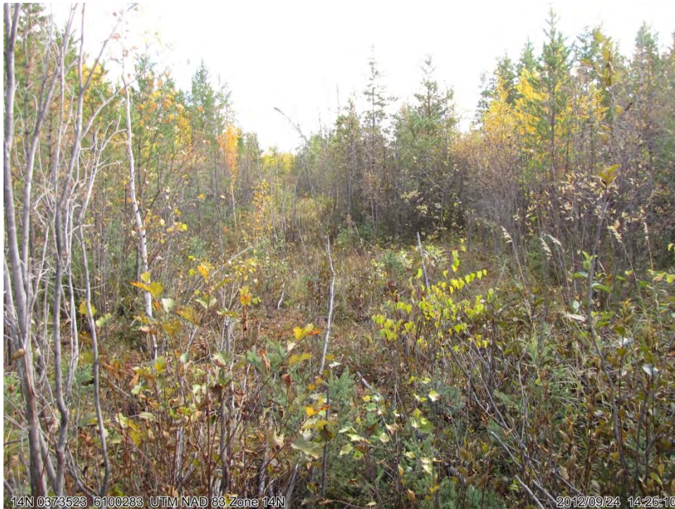
Photograph 06. September 24, 2012: Alder Understory with Grass and Sedge Ground Cover in Central Wet Fen Area near Pit 2 ↑