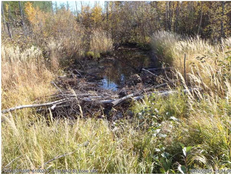
Photograph 16. September 25, 2012: PLM-01, Beaver Dam, Looking South ↑