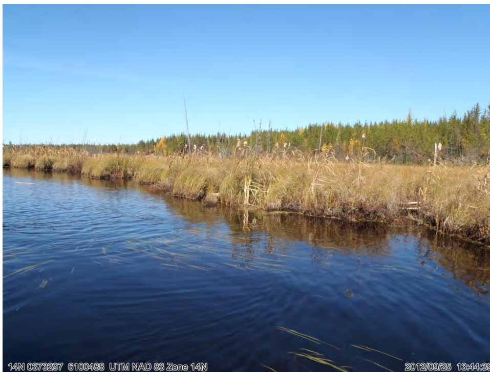
Photograph 26. September 25, 2012: Wetland Grass Shoreline of Fire Pond, Looking North ↑