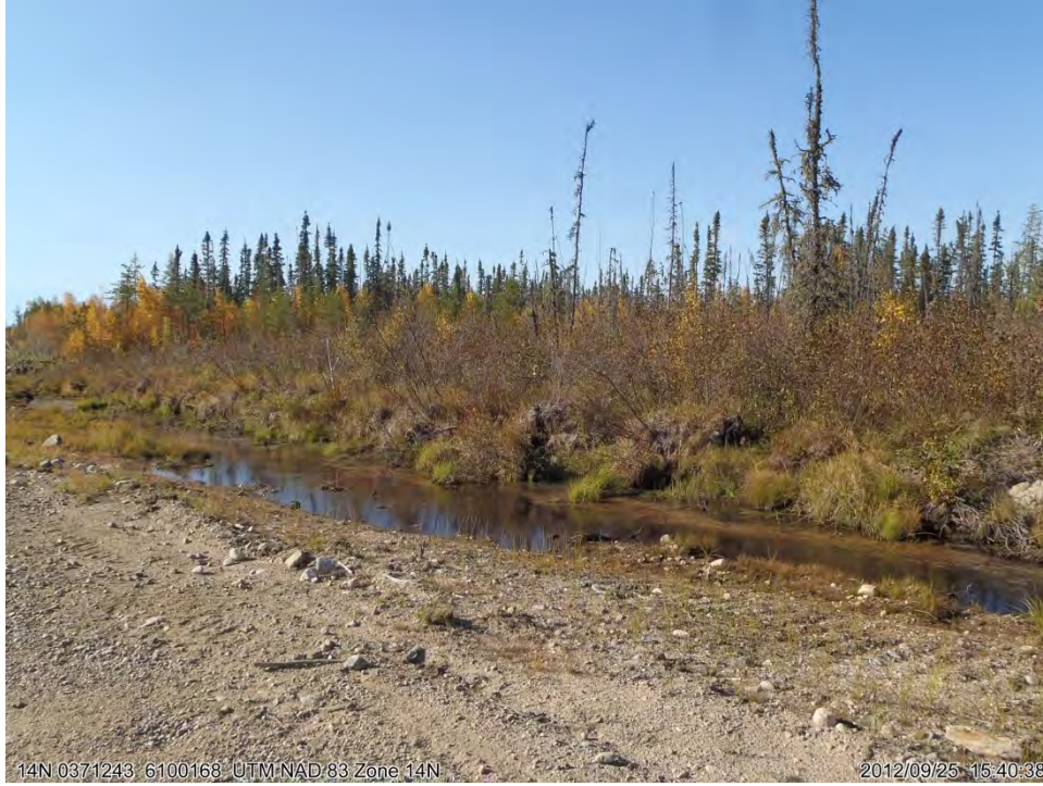
Photograph 17. September 25, 2012: PLM-02, Wetted Area Adjacent to Main Access Road, Looking Northwest ↑