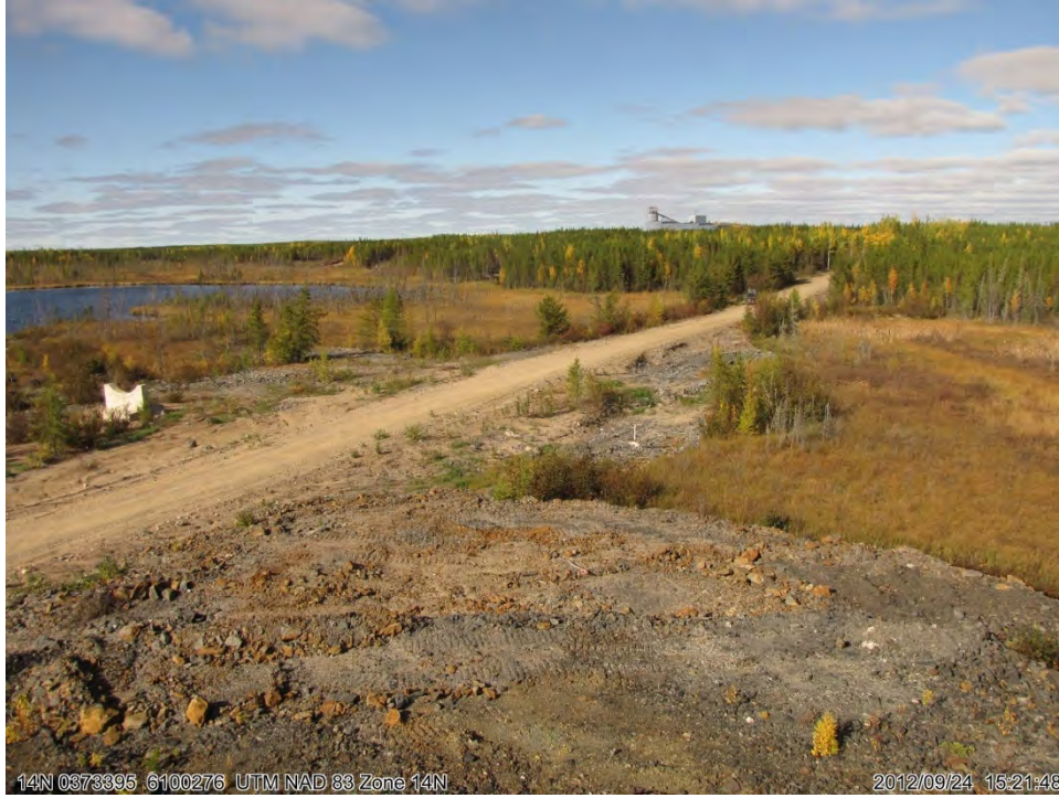
Photograph 27. September 24, 2012: Fire Pond, On-Site road, and Fen South of Fire Pond, Looking North to Mill ↑