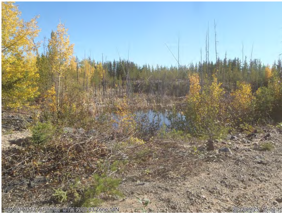
Photograph 24. September 25, 2012: Small Wetted Area Along On-Site Road, South of Tailings Beach at Ragged Lake TDA, Looking East ↑