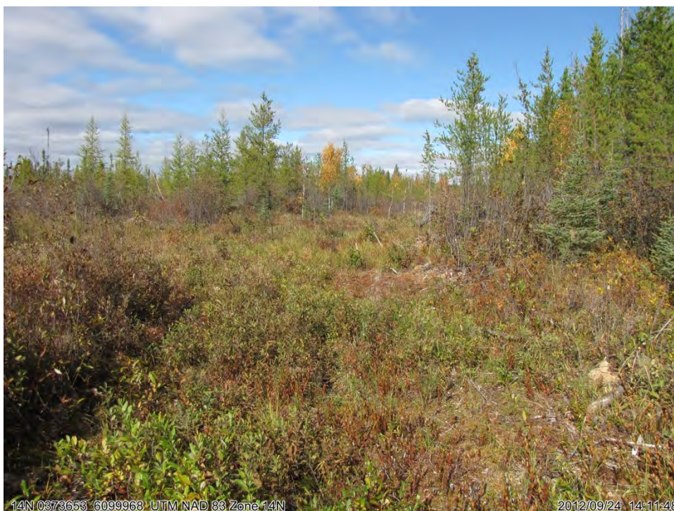
Photograph 04. September 24, 2012: Trees and Wet Meadow on East Boundary of Pit 1 ↑