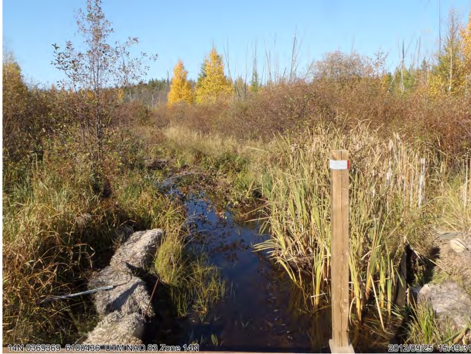
Photograph 19. September 25, 2012: PLM-03, Small Creek, Looking North and Downstream ↑