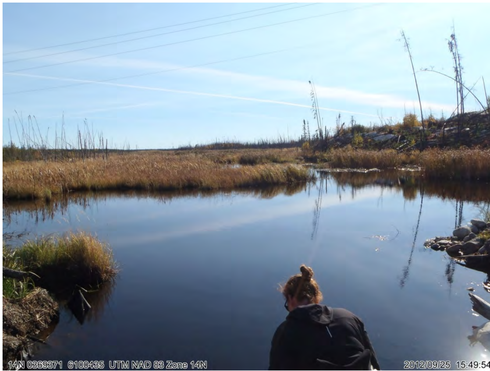
Photograph 18. September 25, 2012: PLM-03, Large Marsh, Looking South ↑