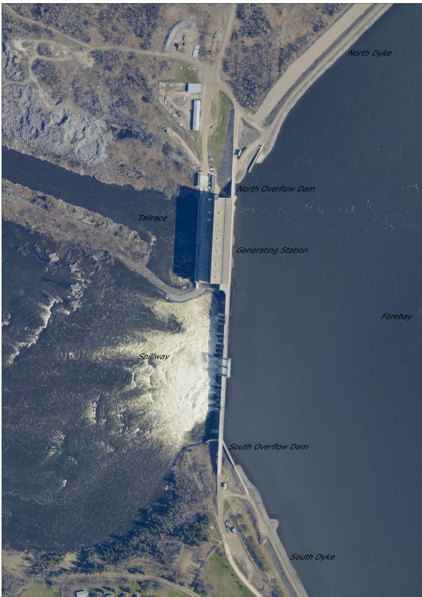
Seven Sisters Generating Station, Date of photography: 2009